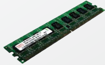
PC3-12800 DDR3-1600 UDIMM Memory